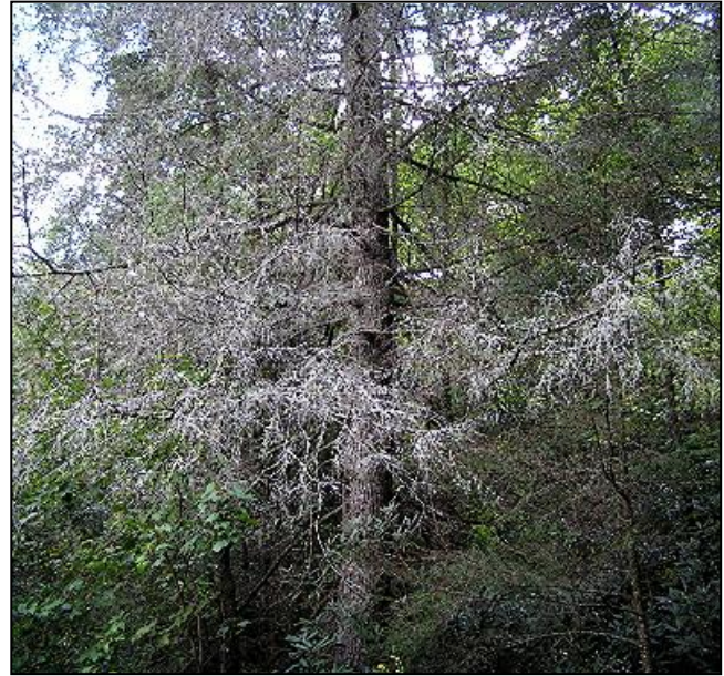
Hemlock Killed by HWA

Similar to the blight that killed over 3 billion America Chestnut trees throughout eastern North America in the 1930's, another pest, the Hemlock woolly adelgid (HWA) , has been destroying our Hemlock forests since the 1950's. At present, the devastation from this tiny parasite has spread from Virginia north to Maine and south to Georgia. In Virginia alone 80% of the Hemlocks in the Shenandoah National Park have been killed, according to the National Park Service. Until recently, the average person in Georgia has been unaware of the approaching danger, but unless we become aware, alert, and active, we may only be able to describe to our grandchildren the graceful Hemlock giants that once forested north Georgia's mountains.